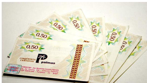
Figure 1: Palmas currency for Banco Palmas

The name Palmas clearly refers to the territory of the Conjunto Palmeiras , which was initially dotted with palm trees. The CCC consequently reflects the very name of Banco Palmas and its history, struggles and conquests (Melo, 2009). The name “Palmas” is indeed commonly used by inhabitants to refer equally to Asmoconp, Banco or Instituto Palmas, and the CCC.