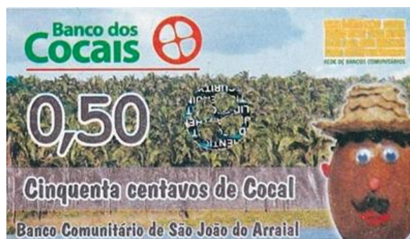
Figure 2: Cocais currency for Banco dos Cocais – São João do Arraial

“The ability to create yourself your own money, to have this power, that it is here because we decided that it would be like this, is great. And after you take this money and go buy the goods, this is a fantastic thing! We feel that people are surprised with this power.” (quote, interview – December 1st, 2011)