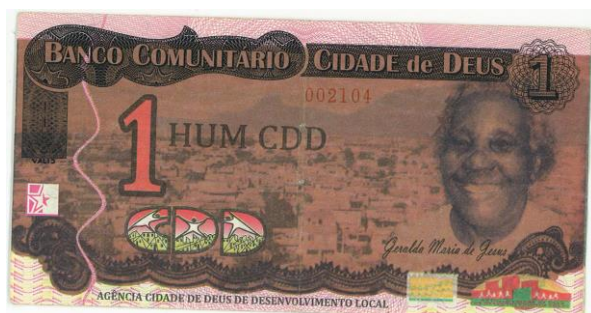
Figure 3: CDD currency for Banco Cidade de Deus – Rio de Janeiro